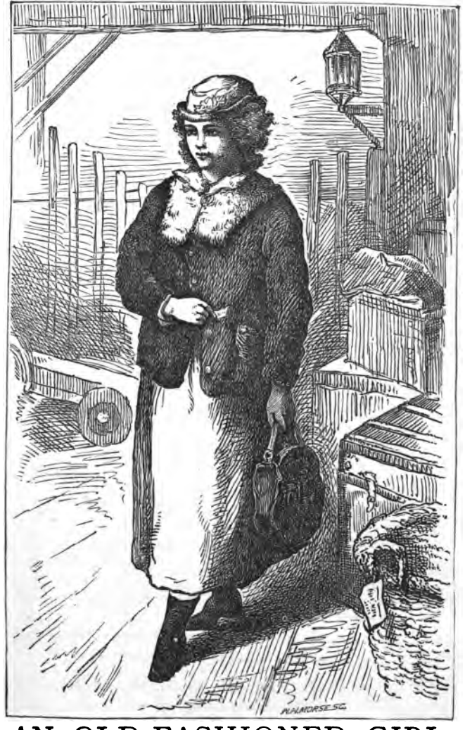
AN OLD-FASHIONED GIRL. PRICE $1.50.